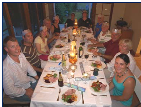
Christmas dinner with our family

For us, we spent two relaxing weeks at the farm with our families. Not surprisingly we ate and drank more than we probably should have, but a good time was had by all. We had some of the younger members of our extended family join us as well, and they thoroughly enjoyed getting their hands dirty around the farm.